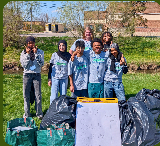
PEL Earth Day Clean Up

On April 22, Earth Day, they recruited 10 wonderful volunteers to clean up a creek and collected over 50 lbs of trash and recyclables within two hours! Some of the volunteers were alumni and friends from their school. It was a wholesome moment for our staff.