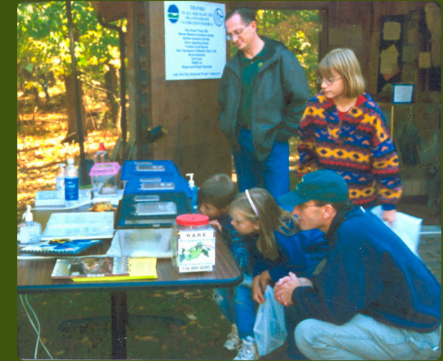
In 2001, the "Education Center" was a garden shed visible in this photo from the first Fall Festival.

In 2000, I interviewed for a job in DEC's downtown Buffalo office. When I was told the job would include developing an environmental education center in Depew, I was very excited. Although I had never heard of Reinstein Woods, environmental education had been woven into my experiences since my undergraduate days. I was eager to dig into education full time, and also to try my hand at managing a large property.