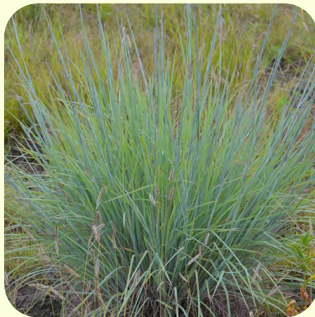
Little Bluestem Grass

Bluish-green grass that forms dense mounds.