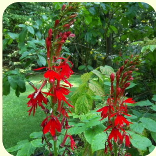
Red Cardinal Flower

Beloved by hummingbirds and butterflies! Grows great in a rain garden.