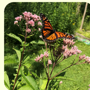
Joe Pye Weed

Dusty rose-colored flowers, magnets for butterflies.