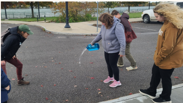
Environmental Justice Stewards test permeable pavement.

The program also introduced students to environmental justice issues facing their communities. The students created and distributed an online survey to document