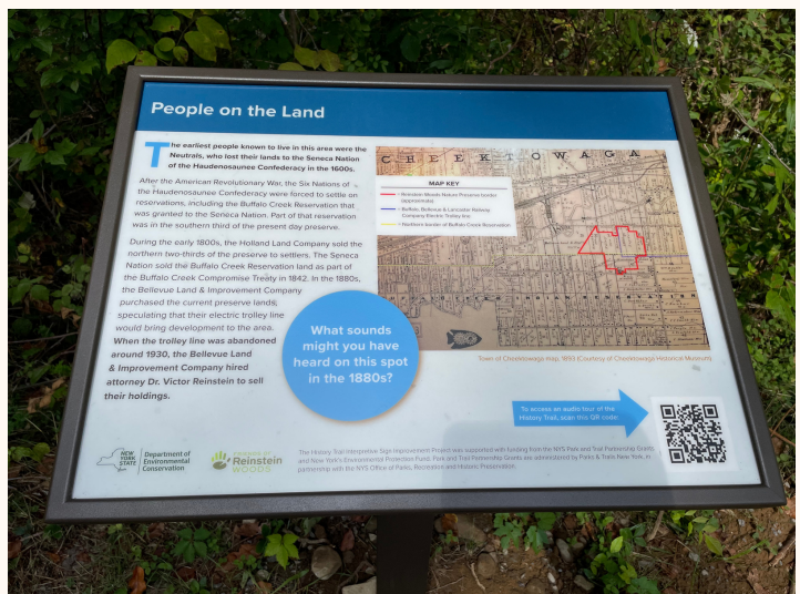
interpretive Signs like this one tell the history of Reinstein Woods.