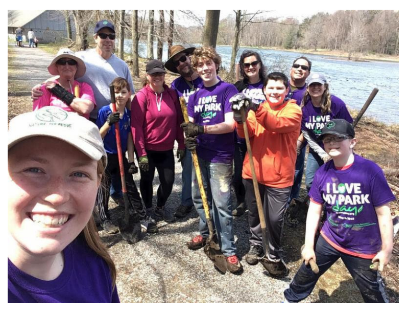
Earth Day in May/I Love My Park Day

Join us Saturday, May 4, at 10 am to care for our trails and habitats. We'll rake trails, pick up trash, and plant native wildflowers and shrubs. Families, scout troops, and other organizations are encouraged to attend. Friends of Reinstein Woods will provide a light lunch to thank you for your hard work. Let's keep the Earth Day spirit alive by showing our appreciation for the planet in May! Online registration for this state-wide event will open in April. Visit www.reinsteinwoods.org.