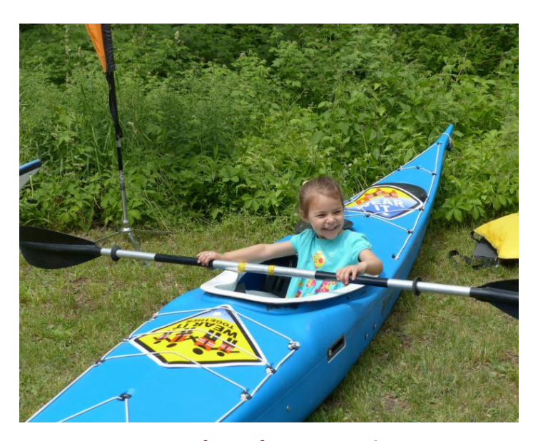
Get Outdoors! Community Day

More information about which items can be fixed will be available as the date approaches. To offer your services as a volunteer fixer, call (716) 683-5959.