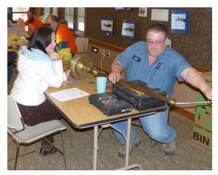
Dare to Repair Cafe