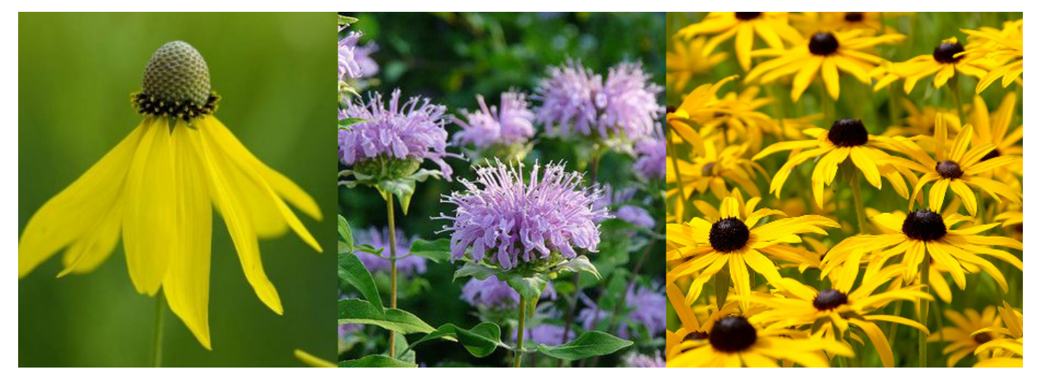
Plant Sale Vouchers Still Available

Thank you to everyone who ordered plants through our plant sale! Remember to mark your calendars for Saturday June 1 (10 am-1 pm) or Monday, June 3 (5 pm-7 pm) to pick up your plants.