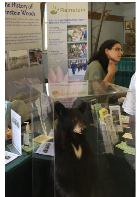
Reinstein's bear mount on display in its new case at the Erie Co. Fair