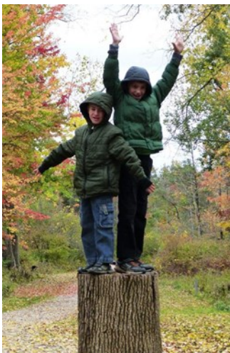
Kids at "Passport to Play"

Fall passed quickly at Reinstein Woods, with fun annual events like the 16th Annual Fall Festival and new events like "Passport to Play" held in partnership with the Buffalo Zoo in late October.