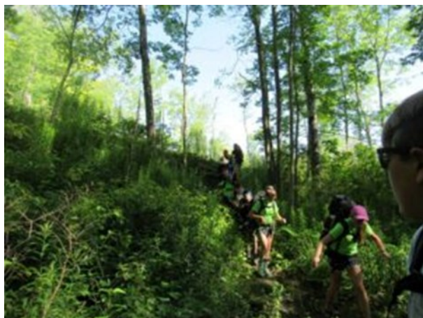
Campers on a Hike at Camp Rushford

Four of the campers in this program received "Outstanding Camper of the Week" awards. Some of them will have the opportunity to return to camp next year, furthering their development as the next generation of environmental stewards.