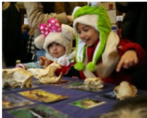
Visitors Enjoying Exhibits

No registration required. Check http://reinsteinwoods.org/events/ for event updates!