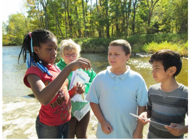
Students collecting water samples from the Buffalo River

This event is held once a year in the early fall and is designed for middle and high-school students. If you are interested in having your class participate, please contact Reinstein Woods Nature Preserve at 716-683-5959 or reinsteinwoods@yahoo.com .