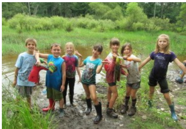
Kids in the Woods Campers

There are still a few spots open in Reinstein Woods' summer day camps, including the new Junior Naturalists Camp , an exciting 3-day camp for the budding scientist, artist or outdoor enthusiast in grades 7 to 9!