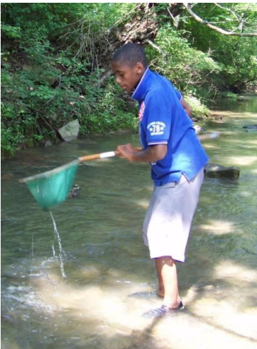
Camper Collecting Animals from a Stream