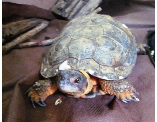
Clementine the Wood Turtle

On a walk through Reinstein Woods, look for “shiny black rocks” on logs laying in Lily Pond and Green Heron Pond. Those “rocks” are actually painted turtles basking in the sun. Sometimes the turtles will stack right on top of each other!