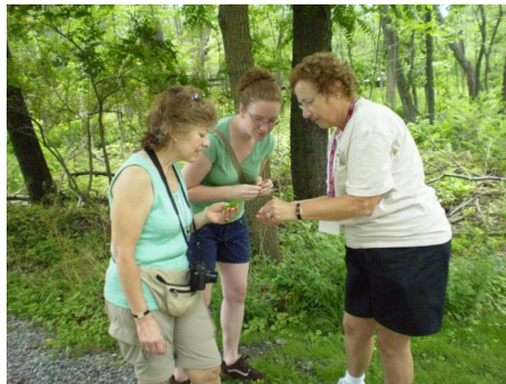
Tour Guide Leading Walk

Starting in June, trained volunteers or staff will lead a no-registration required "Woods Walk" at 11 a.m. on the first and third Saturday of each month. These walks will sometimes feature a theme focusing on a certain topic such as birds or insects. Other walks will be "Nature Guide's Choice" and may cover a range of wild discoveries at Reinstein Woods.