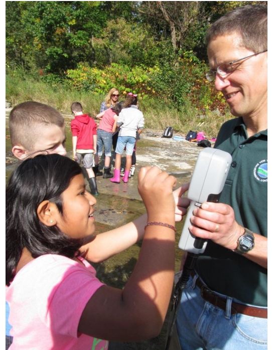
DEC Biologist Testing Water Quality