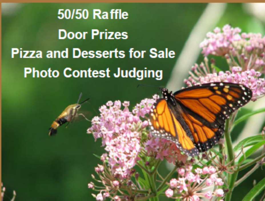
Photo Contest Judging