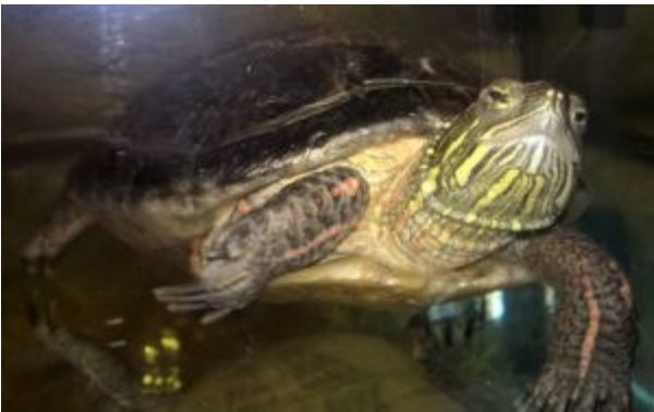
Clover the painted turtle swimming in her aquarium

Clementine is a wood turtle. Wood turtles take their name from their preferred woodland habitat, as well as the prominent rings (annuli) on their back that remind some of wood. These colorful turtles spend most of their time wandering the woods along the edge of streams, searching for berries, mushrooms, insects, worms, and small aquatic creatures to eat.