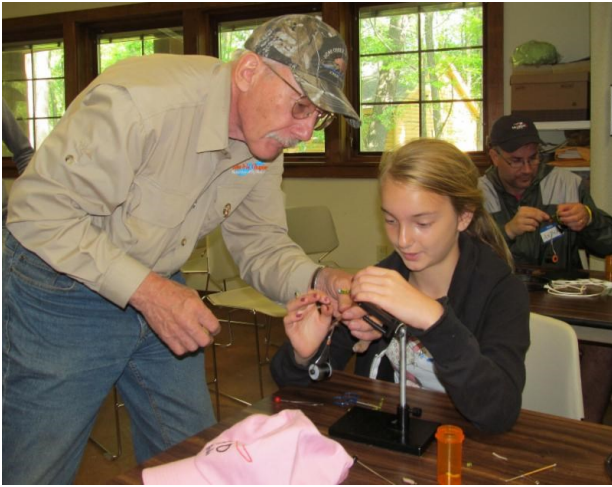
A young angler learns to tie a fly.

In June, Reinstein Woods partnered with Lake Erie Chapter of the Federation of Fly Fishers (FFF) for its third annual youth fly fishing clinic. The weather cooperated very nicely for the group of 32 kids age 9 to 15 and their parents.