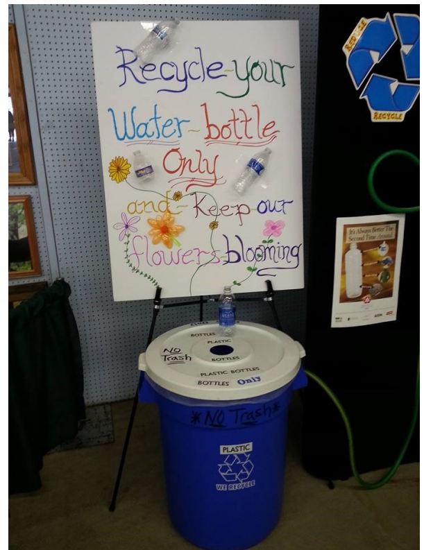
Recycling at Reinstein Woods Erie County Fair display.