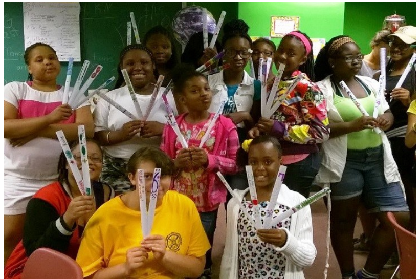
Students at Gloria J. Parks Community Center show off plant markers they made from recycled materials

Additional garden beds and vertical garden beds will be built on the rooftop soon for next year.