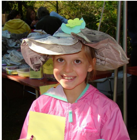
Make a recycled paper hat - pretty or pirate - at the Fall Festival!

September 19 is also "Talk Like a Pirate Day," so we are encouraging everyone to act like a pirate and practice the three RRR's : Reduce, Reuse and Recycle! Bring old sneakers to the festival to recycle , find out how to reduce energy use from the NYS Department of Public Service, and reuse materials by making a "top" in the kids craft area!