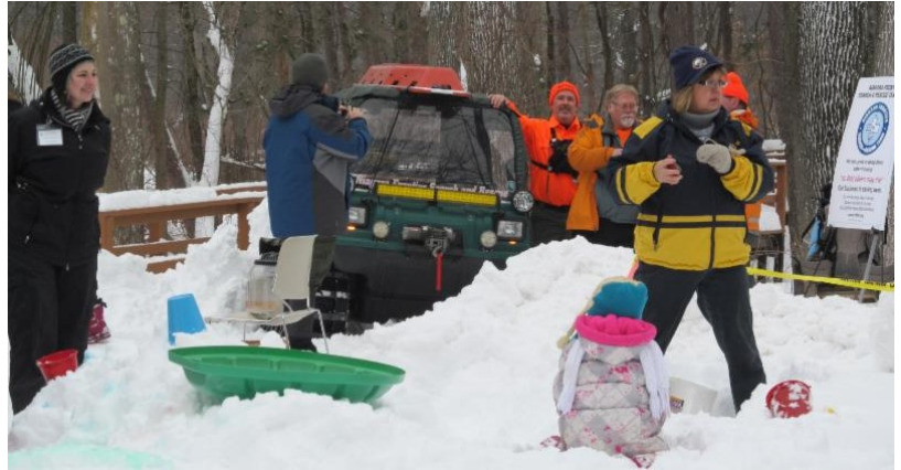
Visitors enjoying the snow

Thanks to a "warm" day and lots of snow, we had a record crowd at Winter Wonderland, with just over 500 people enjoying skiing, snowshoeing, crafts and more! Visitors delighted in interacting with Earth Spirit, Niagara Frontier Search & Rescue Team, SPCA Serving Erie County, and NYS Parks Interpretive Office staff, who all helped make the day successful!