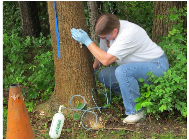
Ash tree being inoculated

Our goal is to raise $1000 to help protect our ash trees from the destructive Emerald Ash Borer beetle. Watch your email for more details as the event approaches, and thank you in advance for your support!