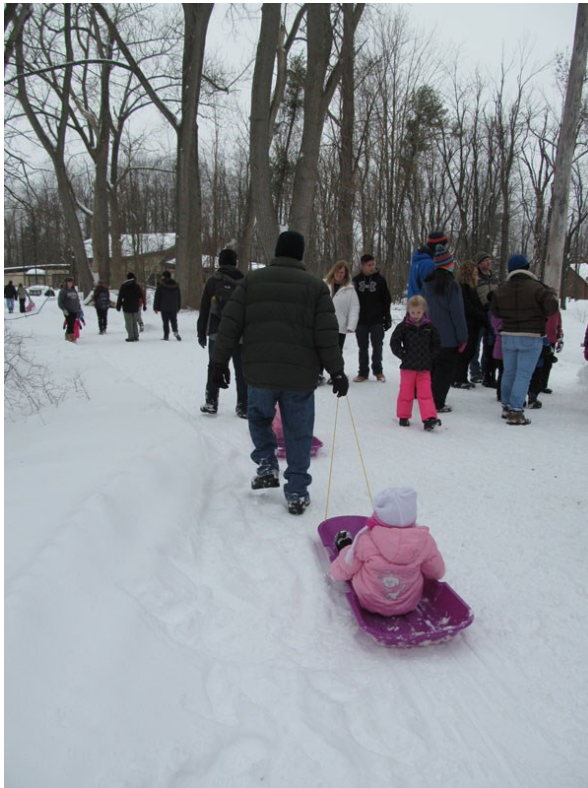
Visitors enjoying the trails

If you missed this event, it's not too late to visit Reinstein Woods to try a pair of snowshoes or skis for yourself by visiting during our rental hours.