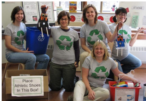
Reinstein Woods Staff recycle...in what year? Email your guess to info@reinsteinwoods.org .

Even items that are torn, stained, missing buttons, or have broken zippers can be recycled. These "textiles," which also include household items like sheets, blankets, curtains and even stuffed animals, are accepted for recycling by many organizations. If the items can't be reused here or abroad, they are broken down into their fibers to be recycled into other useful things!