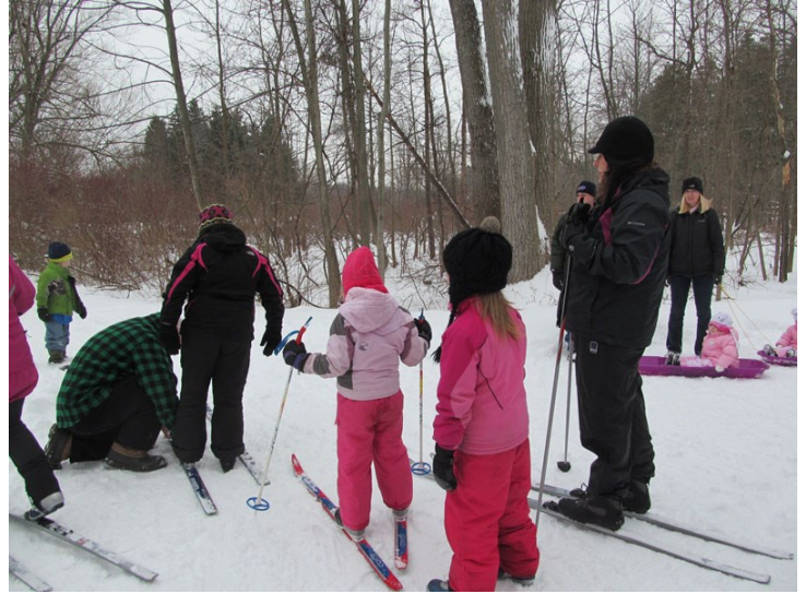
Visitors trying cross-country skiing at Winter Wonderland