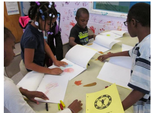
Making Leaf rubbings at After-School Conservation Club

5. The fall session of the After-School Conservation Clubs, sponsored by Reinstein Woods, has started at Gloria J. Parks Community Center and William C. Baird Clubhouse of the Boys and Girls Club in Buffalo. This program introduces kids participating in after-school programs to nature, both by bringing them out into nature, and by bringing nature to them!