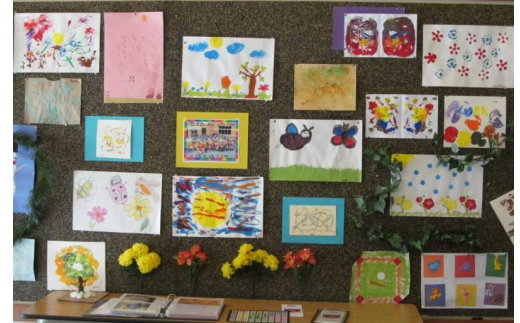
CHC Learning Center Art Exhibit