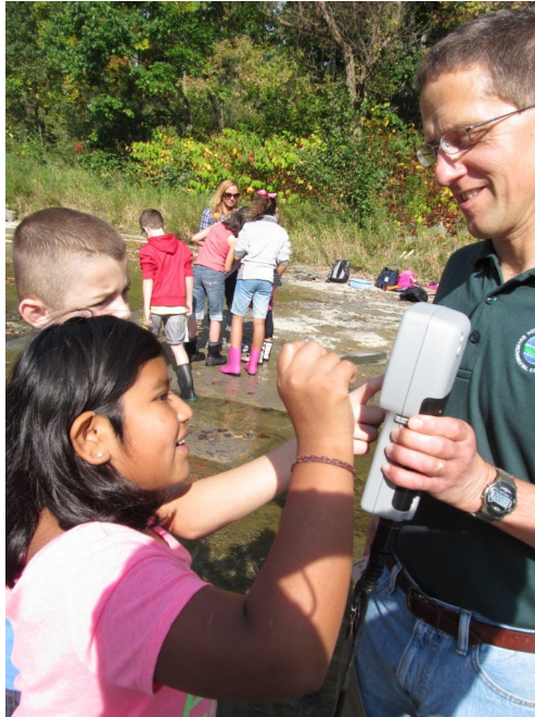
Students checking stream data

Data from all sites will be shared on a website built by SUNY Buffalo State College students so classes can compare their data with other participants and previous year's results.