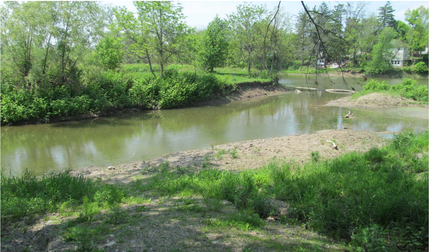
Sample site is river bank at the bottom of the slope. Bridge is on the left, island, peninsula, and main river is on the right.