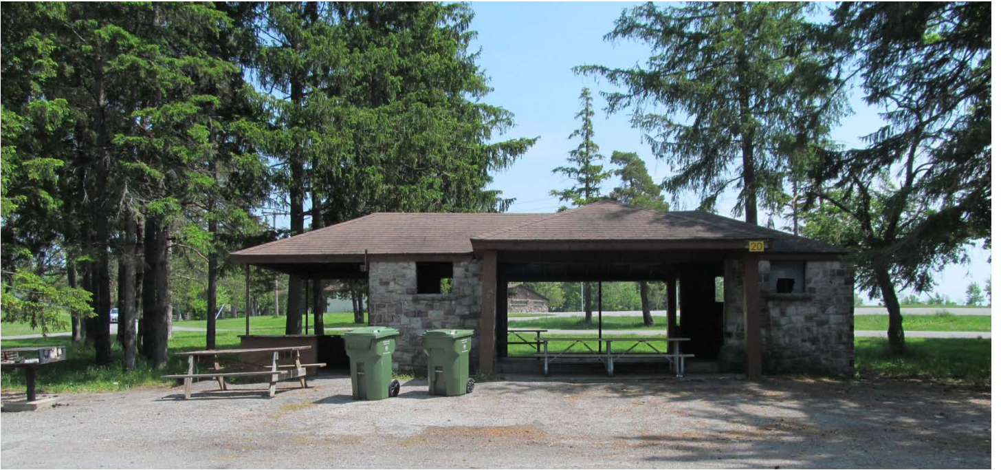
Picnic shelter near parking lot.