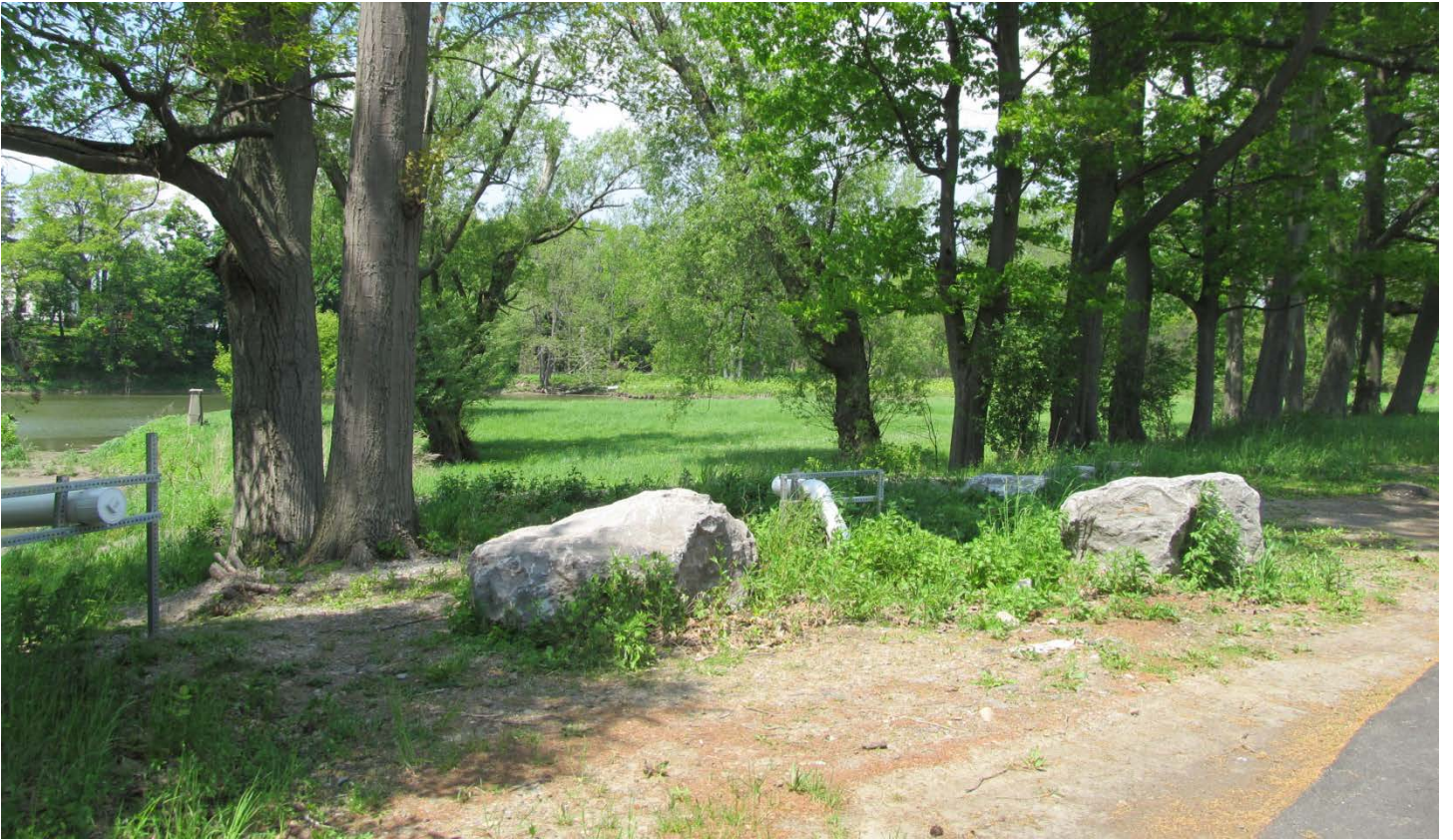
Turn left by the boulders towards the river.