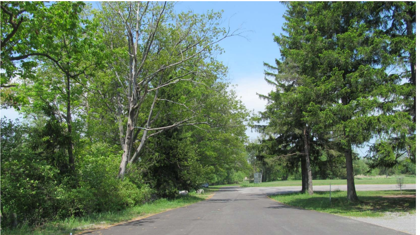
Follow the road away from the bridge. The picnic shelter will be on the right, the river on the left.