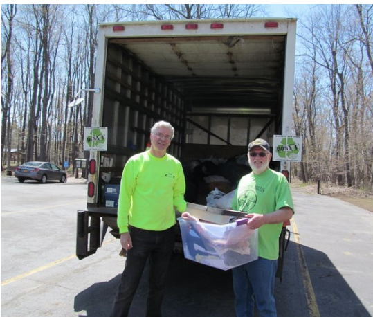
Left: Textile recycling