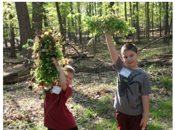
Right: Garlic Mustard Removal

If you missed that event, you can recycling clothing and textiles on any visit to Reinstein Woods by placing them in a tied plastic bag and putting the bag in the red Hearts for the Homeless collection bin in our parking lot.