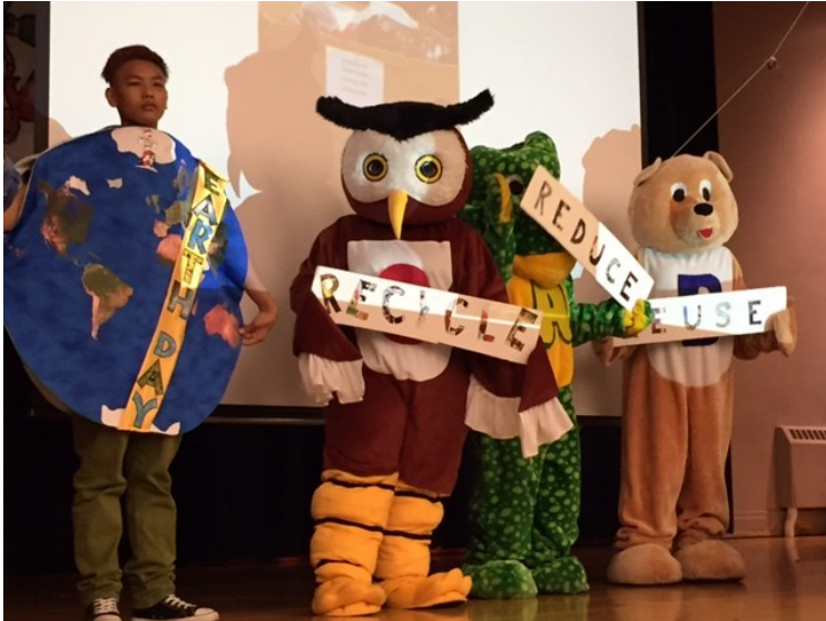
BPS 45 mascots get kids excited to recycle!

You may recall from the last newsletter that New York is making a push to keep clothing out of landfills by raising awareness about what to do with old clothing and textiles. To help promote this effort, Friends of Reinstein teamed with the City of Buffalo, DEC and the WNY Coalition for Donated goods to sponsor an “Earth Day Clothing Drive” in Buffalo Public Schools.