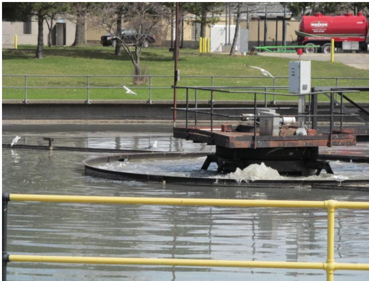
Clarifying tank at Bird Island Treatment Plant

Thanks to Friends' board member Denine Jackson, who works in the laboratory at the plant, the Reinstein Woods staff recently toured the plant to better understand the water systems we discuss with students during our popular "Watershed Works" program. On the day of our visit, the plant was anticipating about 120 million gallons of wastewater to flow through the plant, just on that day. The plant is rated to accept up to 560 million gallons per day.