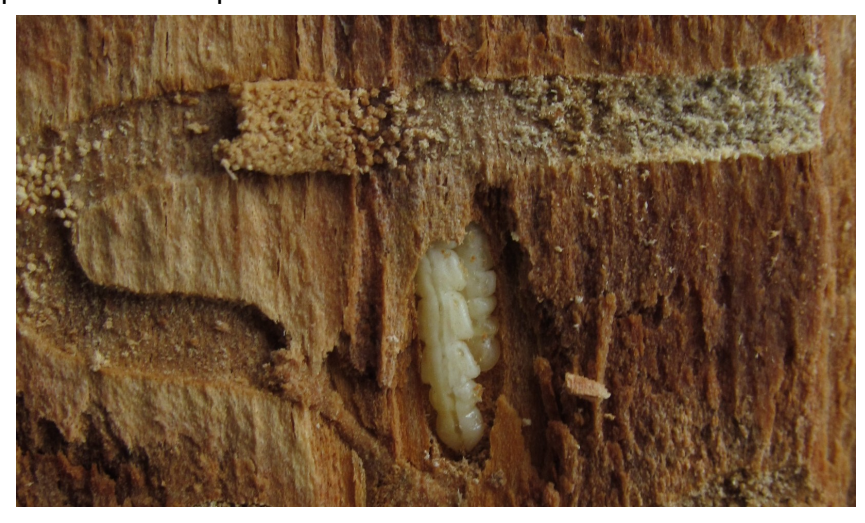
Emerald ash borer larva under ash bark

Plans are underway to protect a number of still-healthy ash trees at Reinstein Woods, and we anticipate the treatment happening in late spring. The funds raised by Katherine and Spring It On will be used to provide this treatment.